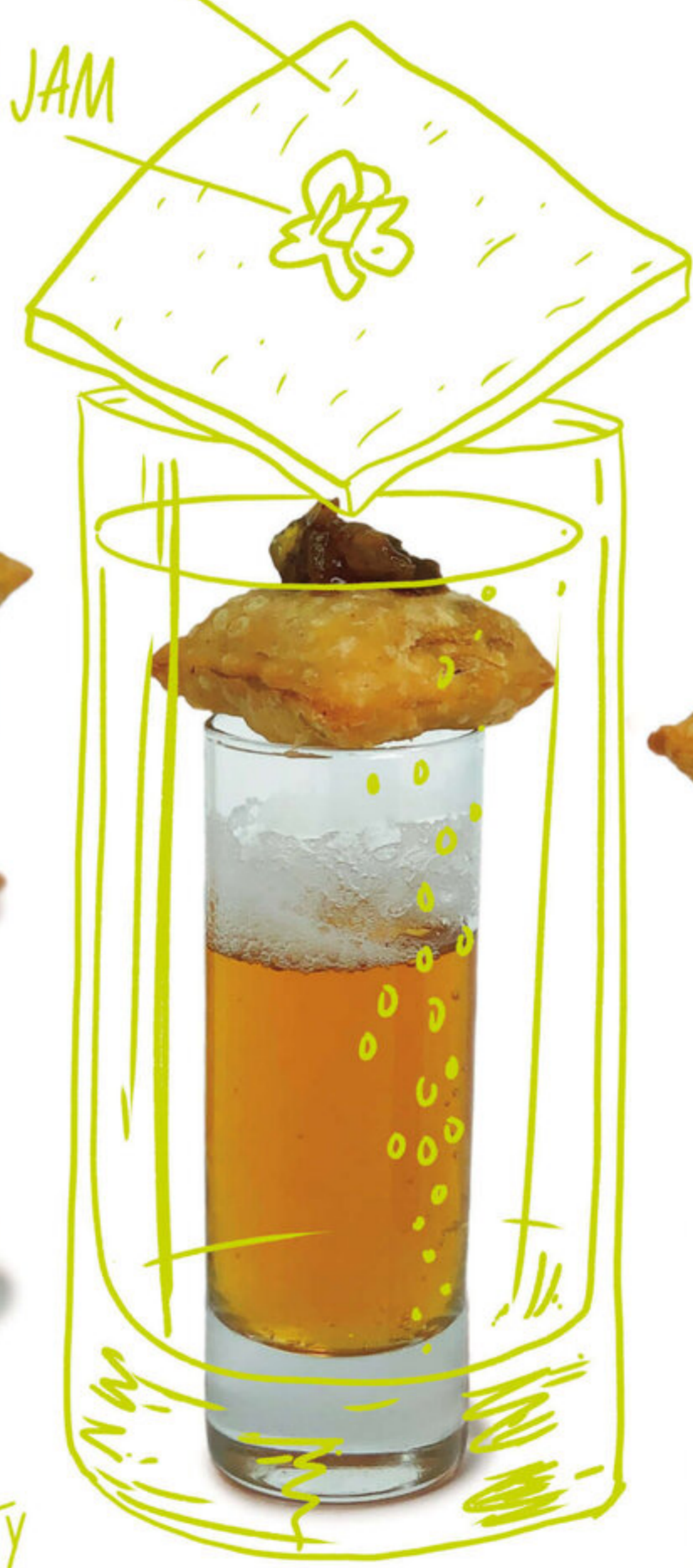
RED STRIPE + GINGER BEER