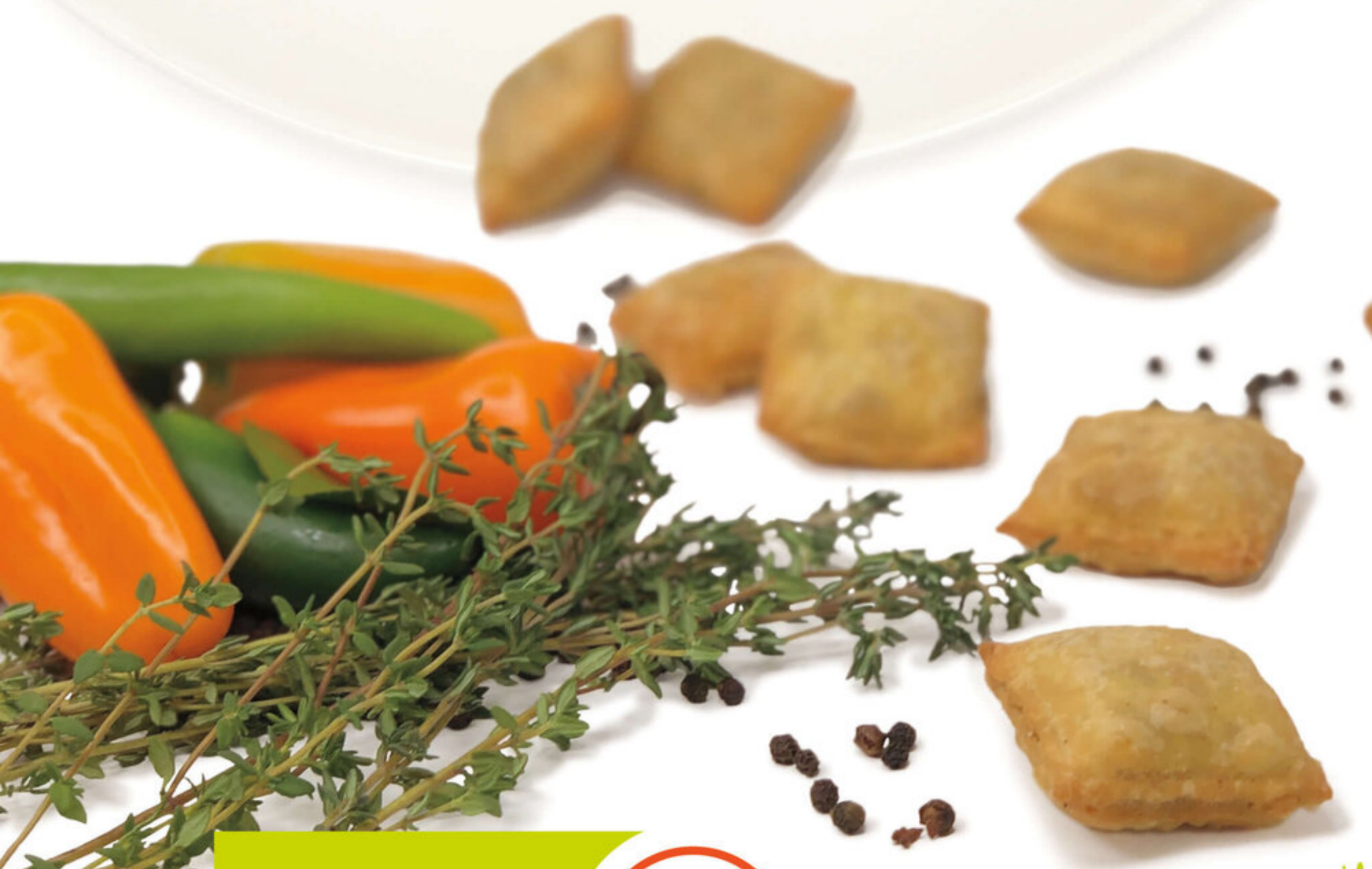
JAMAICAN BEEF PATTY + RED STRIPE SHANDY SHOT

see more of what is in season @ schaffer_la