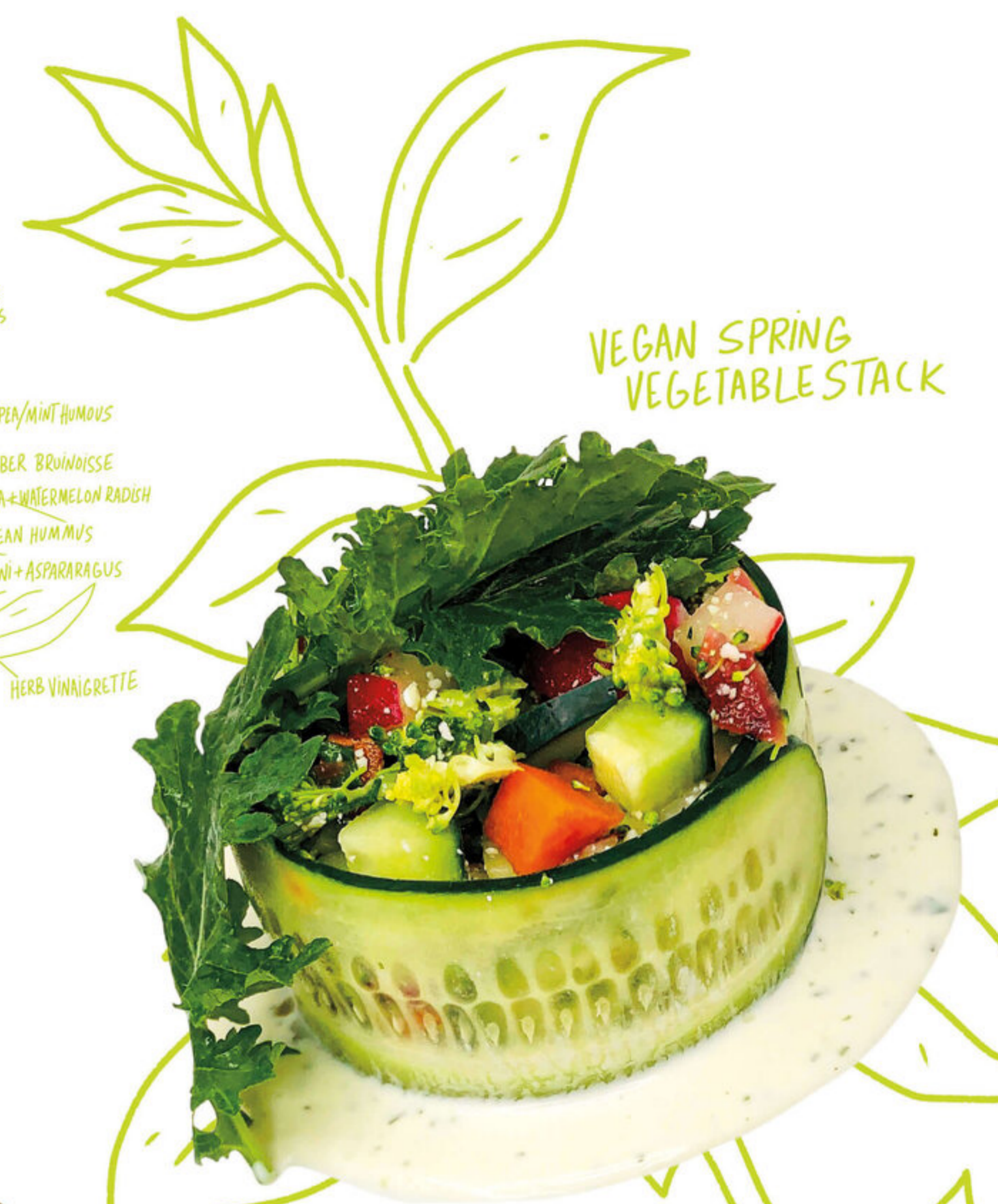
VEGAN SPRING VEGETABLE STACK